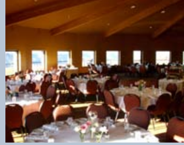
The Estate Room