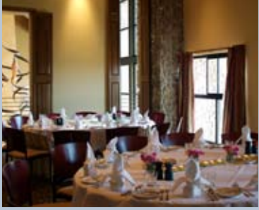
The Cordon Room