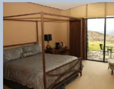
Cavern Room Interior