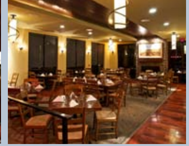
Tendrils Vineyard Restaurant