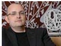
Environment, February Vulcan Real Estate Strikes a Sustainable Pose