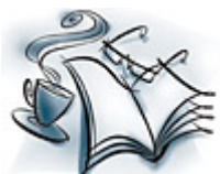
Bookend, February Bookend