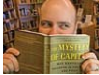
Finance, February, Entrepreneurs I'm Too Sexy for an IPO