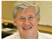
February, The Good Citizen Business Leaders Go Back to Preschool