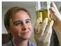
Environment, February Betting on a Green Future