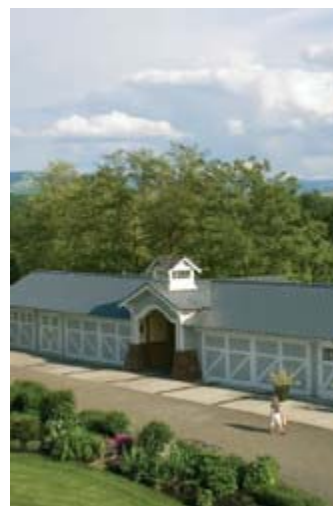
A converted carriage house sits c century farmstead near Walla Wa Reynolds)

- Cave B Estate Winery's location, on a property called SageCliffe, is stunning - 700 acres carved into the landscape above the Columbia River near the town of George and the Gorge Amphitheater. Tucked in the middle of vineyards sit 30 guest rooms, including 15 individual "cliff houses" poised 900 feet above the river. Within a stone's throw is a cozy restaurant, Tendrils, serving Northwest cuisine.